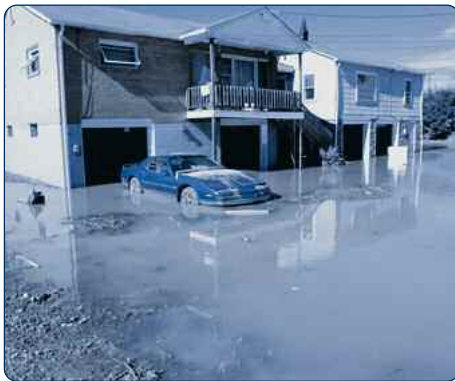
Flooding. Canton, NC, September 18, 2004 – Photo by Leif Skoogfors/FEMA Photo.

If your household uses a typical septic system, heavy rains and floods can halt its ability to treat wastewater from your home. When rainwater or flood waters pond over the drainfield, there is no place for wastewater from the household plumbing to drain because the drainfield and soil beneath are saturated, and your entire system can fail.