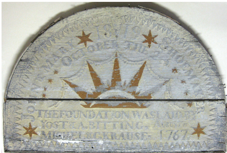
Original date board from Sunrise Mill, c. 1819.